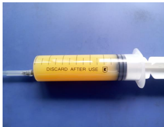
Figure 1: appearance of ascitic fluid: milky.

Many studies have shown that the formation of chylous ascites after portal hypertension caused by liver cirrhosis indicates the disease progress rapidly with a poor prognosis [1,2]. We managed the disease effectively with the low fat, a high protein triglycerides diet, partial parenteral nutrition, abdominal puncture, drainage, symptomatic treatment, combined with diuresis, protecting the liver, and the octreotide. The treatment is effective and safe, it is worth using for reference in a clinic.